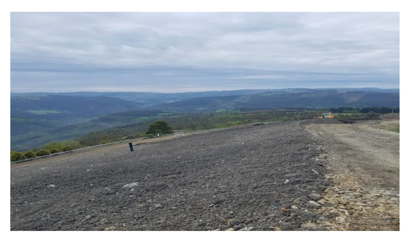
Xiloga landfill site at As Somozas, Galicia. During the transformation.