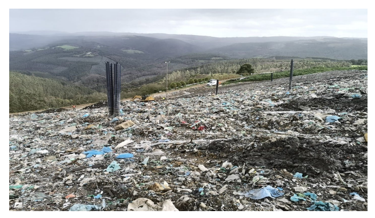
Xiloga landfill site at As Somozas, Galicia. Before the project.