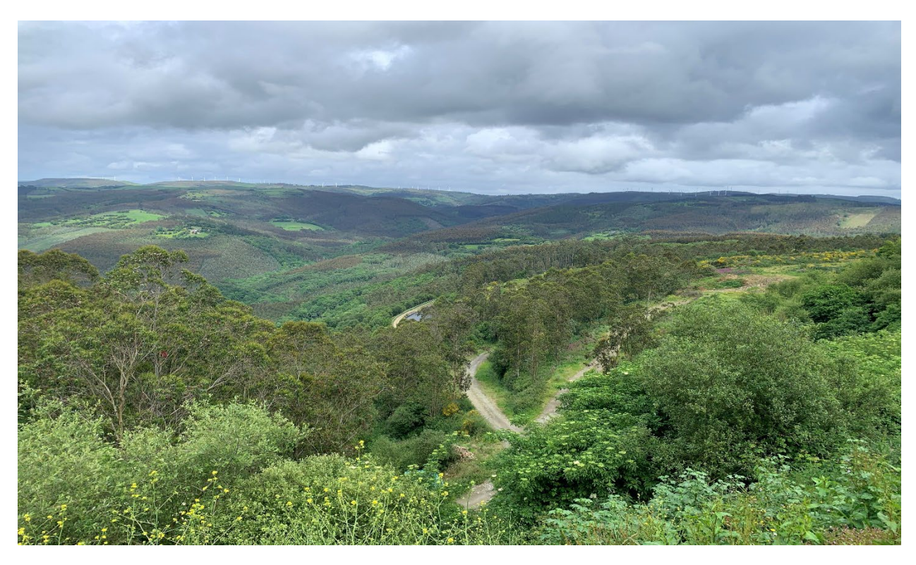
Xiloga landfill site at As Somozas, Galicia with the treatment wetlands under construction.